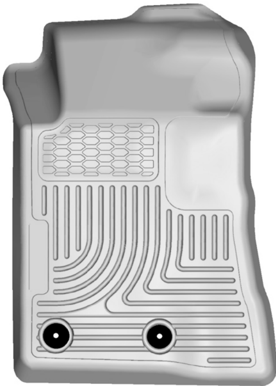
LEFT OR DRIVER' SIDE